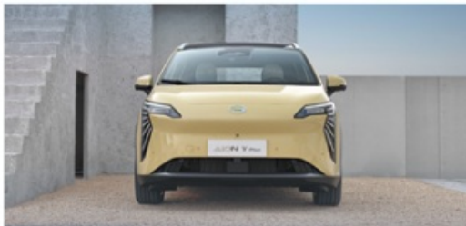
▲ Smart 540° panoramic image