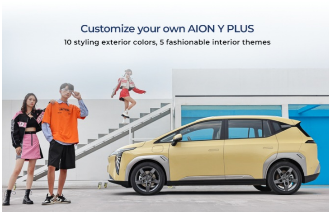
Left Hand Drive Electric Vehicle Aion Y Plus Compact SUV Exterior and Interior

Customize your own AION Y PLUS 10 styling exterior colors, 5 fashionable interior themes