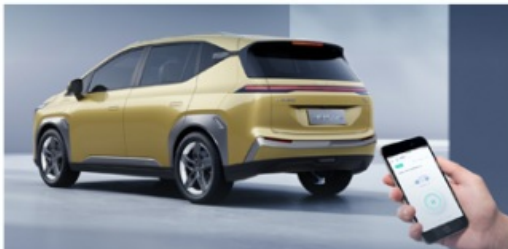
▲ Intelligent remote parking