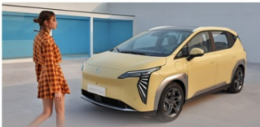
▲ High vehicle safety with magazine battery