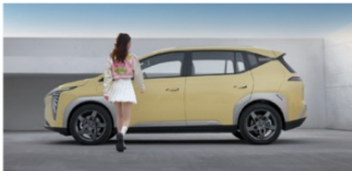
▲ Doors will be automatically unlocked while the driver is getting closer