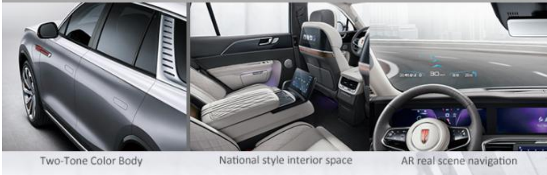
Two-Tone Color Body