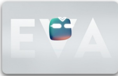
▲ AI Mate Intelligent assistant