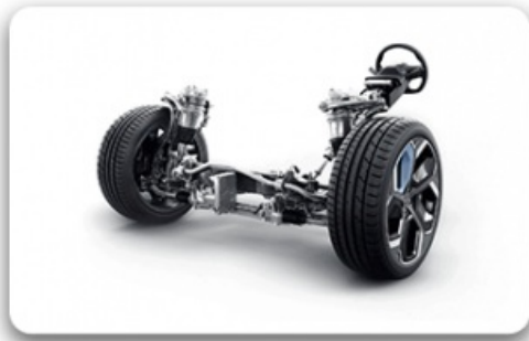
▲ High-performance chassis system